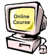
4-Digit Code Online Course (2024)

Starting January 1, 2024, all items are distributed electronically and available free of charge.