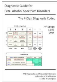
FASD 4-Digit Diagnostic Guide ™ (2024)